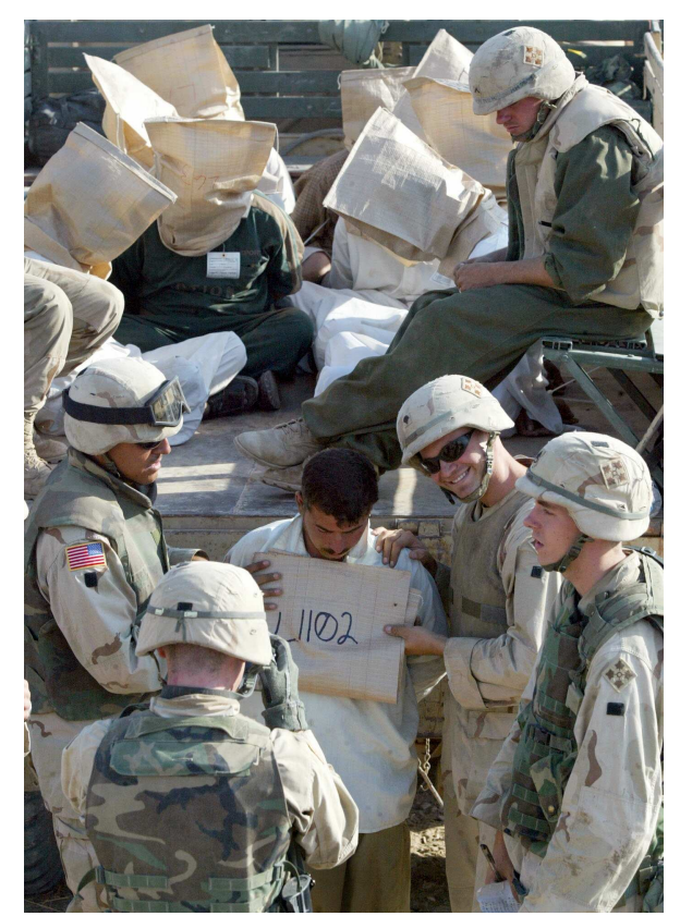
Mishahdah, Iraq: Soldiers from the US Army's 4th Infantry Division round up detainees during a July 2003 operation aimed at pro-Saddam Hussein insurgents. All of the men in the village were reportedly detained during the operation.

says, he sometimes worked at an internet café, in a two-story shopping market called al-Ghufran near the centre of town.