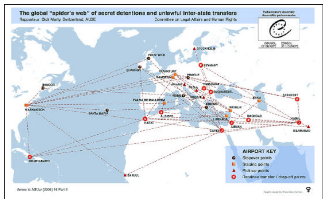
Map from Council of Europe, Committee on Legal Affairs and Human Rights report: "Alleged secret detentions and unlawful inter-state transfers involving Council of Europe member states".

you get a better interrogation." Similarly, one victim of unlawful detention and transfer stated that while held in Pakistan he was interrogated by US officials who told him: "You can co-operate with us the easy way, or the hard way. If you don't talk to us, you're going to Jordan. We can't do what we want here, the Pakistanis can't do exactly what we want them to do. The Arabs will deal with you."